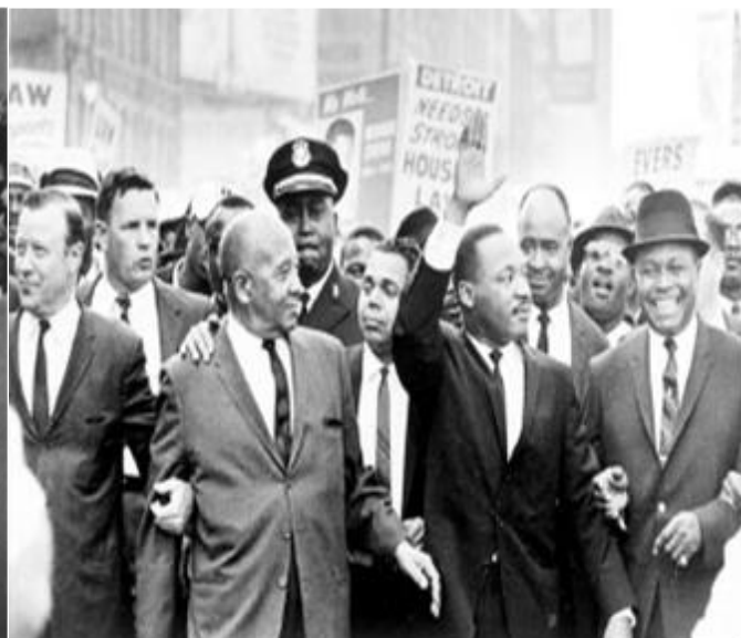
Walter Reuther walks in the front row with Martin Luther King, Jr. during the March to Freedom on Woodward Avenue in Detroit, June 1963.