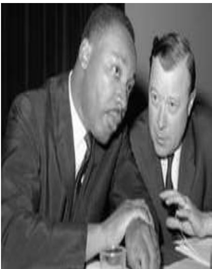
Martin Luther King, Jr Walter Reuther