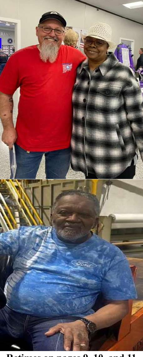
Retirees on pages 9, 10, and 11